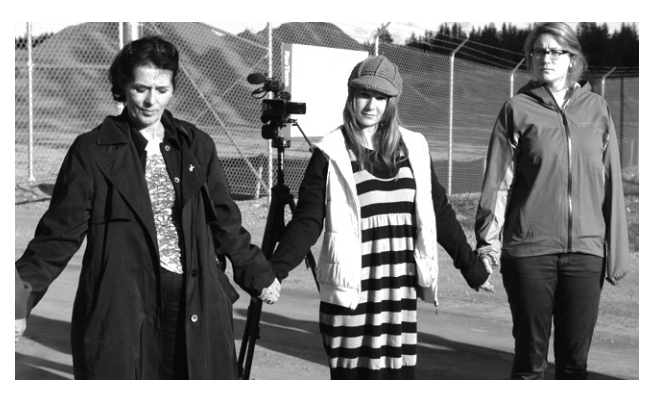
Lois Gibbs (left) protested at the Eagle Rock Mine Project in Michigan in 2010.

Visit <a href="http://toxmap.nlm.nih.gov/toxmap/main/index.jsp">http://toxmap.nlm.nih.gov/toxmap/main/index.jsp</a> and input your location to find out how close you are to toxic releases or hazardous waste sites.